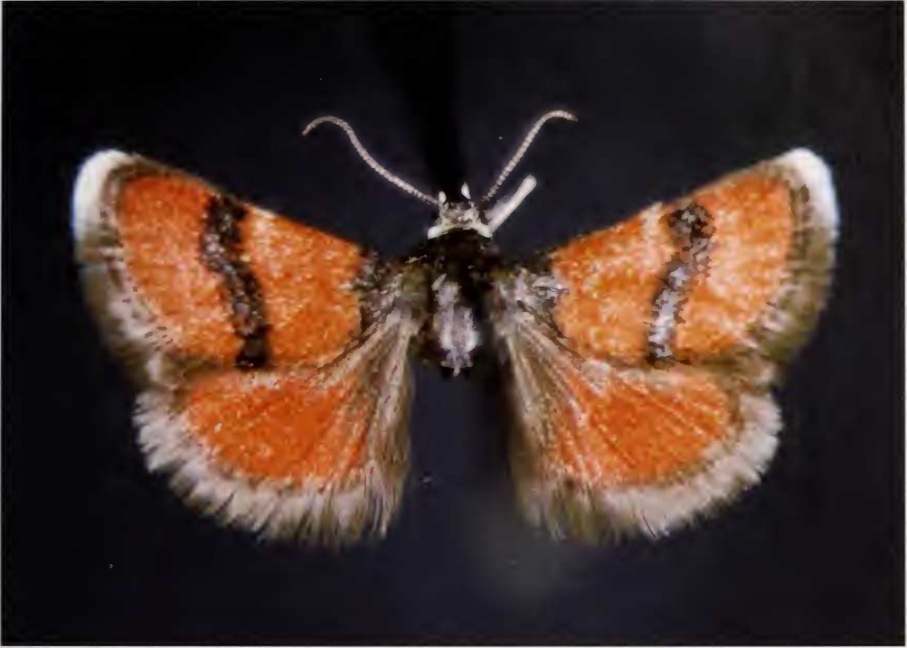
Fig. 3. Titanio caradjae (Rebel, 1902) comb. n. , holotype ♀.

Diagnosis. – Among Palaearctic Odontiinae, this species is unique in possessing vermilion coloured wings with basal area, median line, and tip of termen in forewings shining lead-coloured. With T. normalis , it has in common the enlarged juxta with the bimodal, dentate tip. Further taxonomic studies are necessary to show the phylogenetic relationships of T. caradjae .